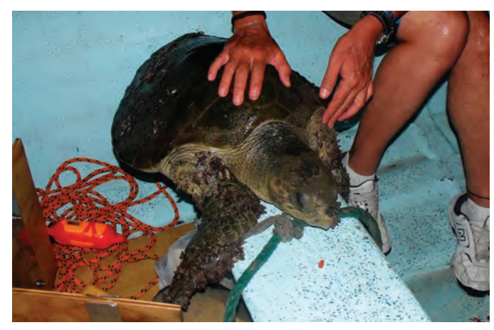
Research with the CastAway-CTD provided a foundation for better understanding of the dynamic ecosystem of Manzanillo's harbor, lagoon and coastal habitat.

For more information on the CastAway-CTD, visit <u>www.ysi.</u> <u>com/castaway</u>.