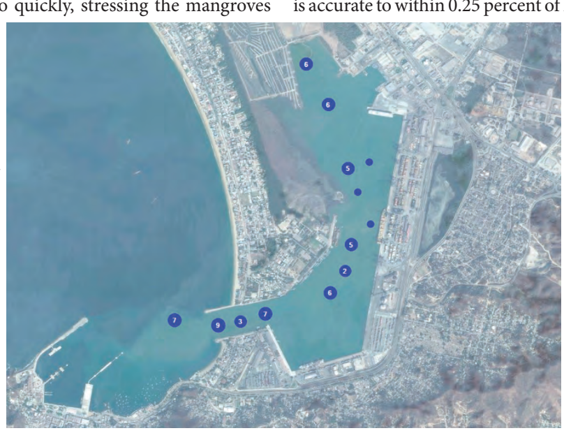
Gathering conductivity, temperature and depth data at multiple sites in Manzanillo harbor was easy with the one- pound CastAway-CTD. Results will guide the reconnection of the harbor with the freshwater lagoon to its north.

Calibration is handled by YSI during annual factory maintenance. Power is supplied by a pair of AA batteries, accessed by a simple twist of the rugged plastic housing. In fact, the only tool required to operate the CastAway-CTD is a plastic stylus to activate the unit's features.